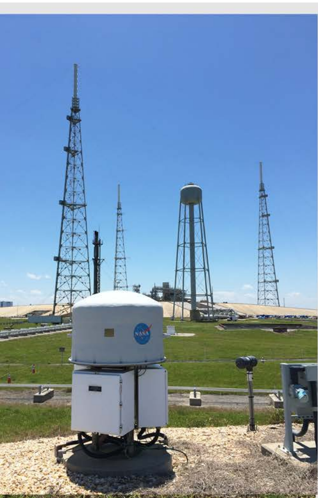
◀ Lightning instrumentation installed at Launch Complex 39B, Kennedy Space Center

SLS provides state-of-the-art digitization systems and sensors for monitoring the electromagnetic and optical emissions of triggered lightning. The digitization systems and sensors have been rigorously tested and qualified both at the ICLRT and at NASA's Kennedy Space Center (KSC) since 2008, and are presently being used to monitor the lightning environment at Launch Complex 39B, the next generation launch facility at KSC for NASA's new Space Launch System rocket. SLS implements customized direct and induced current and voltage measurements for a test article, or alternately, the outputs of customer-supplied sensors or test points can be digitized. SLS also supplies custom, high-bandwidth electromagnetic field sensors for measuring electric and magnetic fields and their derivatives. Finally, SLS provides support for measurements of the mechanical properties of a test article exposed to the direct and indirect effects of triggered lightning (e.g., temperature, displacement, vibration, etc.). The triggering facilities are equipped with high-speed cameras that are used to closely monitor the test article per customer requirements.