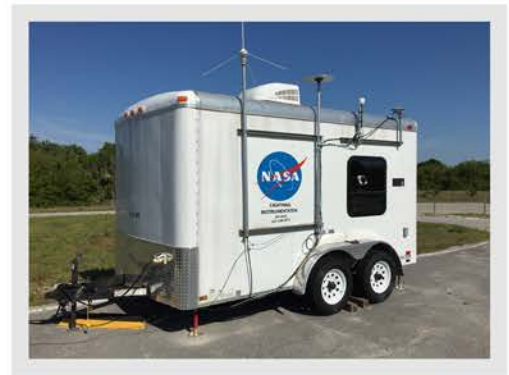
▶ Lightning instrumentation and high-speed cameras installed at Kennedy Space Center